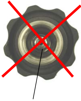
Black nipple tip o-ring, P/N 336-190-437 10 pack